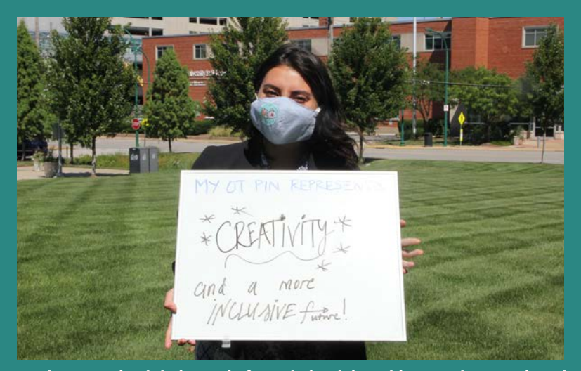
Students received their OT pin from their advisor this year, then continued the tradition of sharing what it means to them for our social media channels.

Our annual Student Orientation three-day event was held Aug. 19 to 21. COVID-19 protocols were in place so that our new classes could participate in the events in person and virtually.